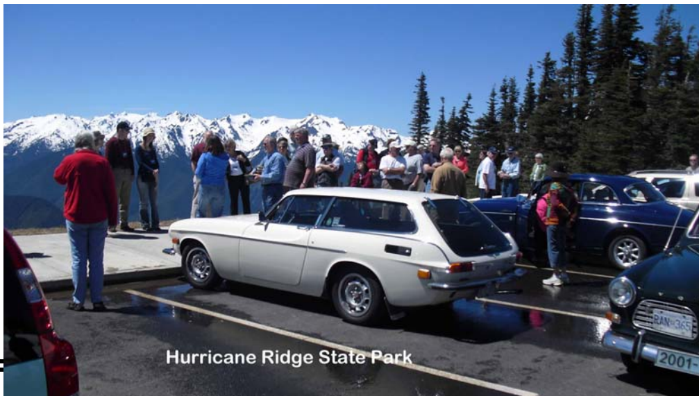
Hurricane Ridge State Park