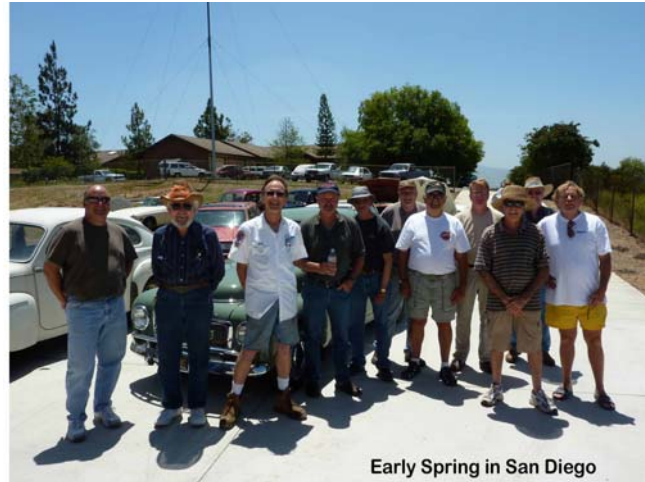
Early Spring in San Diego