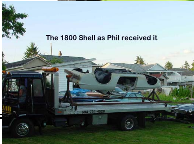
The 1800 Shell as Phil received it

our house and the car was downright docile. Gear changes were nice and the gas pedal complete with skateboard wheel worked great. In second I tromped on the gas and it accelerated smoothly for about a second at which point the big turbo charger woke up and the world went into fast forward. Holy sh-t did it take off. I shifted to 3 rd at probably 4500 rpm and the Turbo pop off valve gave off it's nightmarish 'kahchaaaah!!!' between shifts and we rocketed ahead. Phil looked bored.