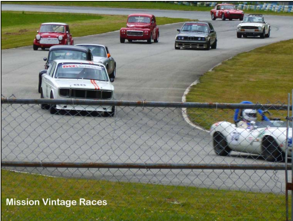
Mission Vintage Races

forecast for Sunday translated to variable intensity rain at the track. Pheasant plucking weather it was too! This year the race event had another challenge. A bridge on Interstate 5 decided that the Friday of the race weekend would be a good time to fall into the Skagit River. The resulting traffic jams made it very tough for the Seattle race teams to make it to Mission. Despite these impediments there was reasonable turnout an enthusiastic group racers and a terrific mix of cars.