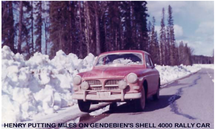
HENRY PUTTING MILES ON GENDEBIEN'S SHELL 4000 RALLY CAR

Henry found life as a service rep was a lot different from life in the dealership. First of all it meant a hell of a lot of driving. He was on the road at least 2 1/2