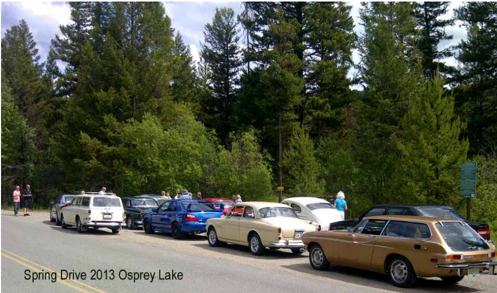
Spring Drive 2013 Osprey Lake