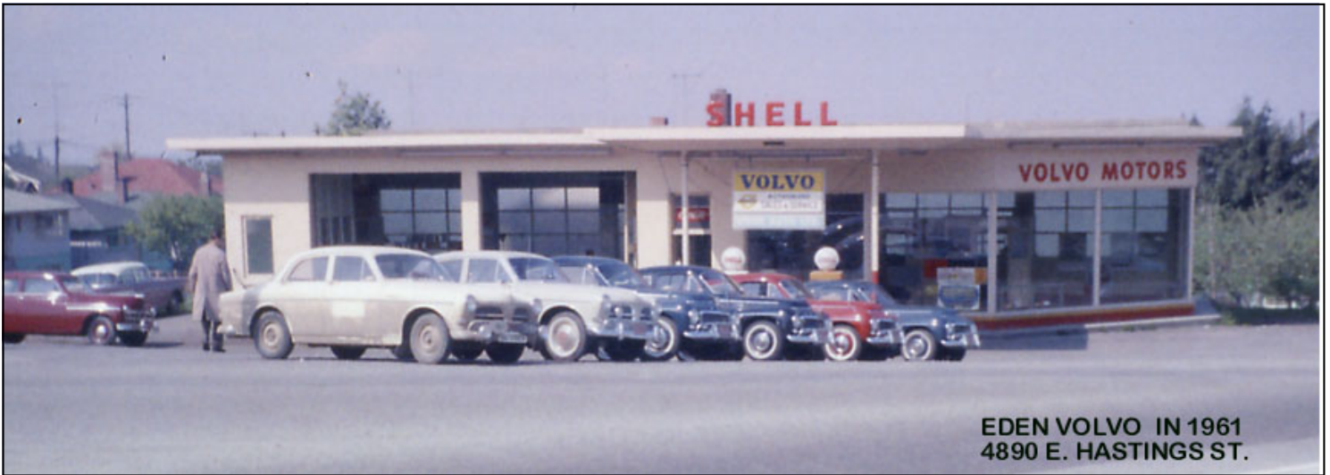
EDEN VOLVO IN 1961 4890 E. HASTINGS ST.