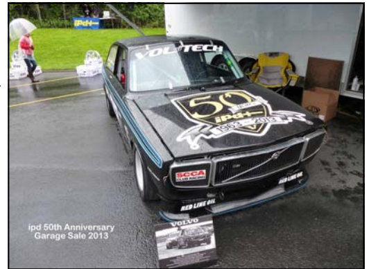
ipd 50th Anniversary Garage Sale 2013