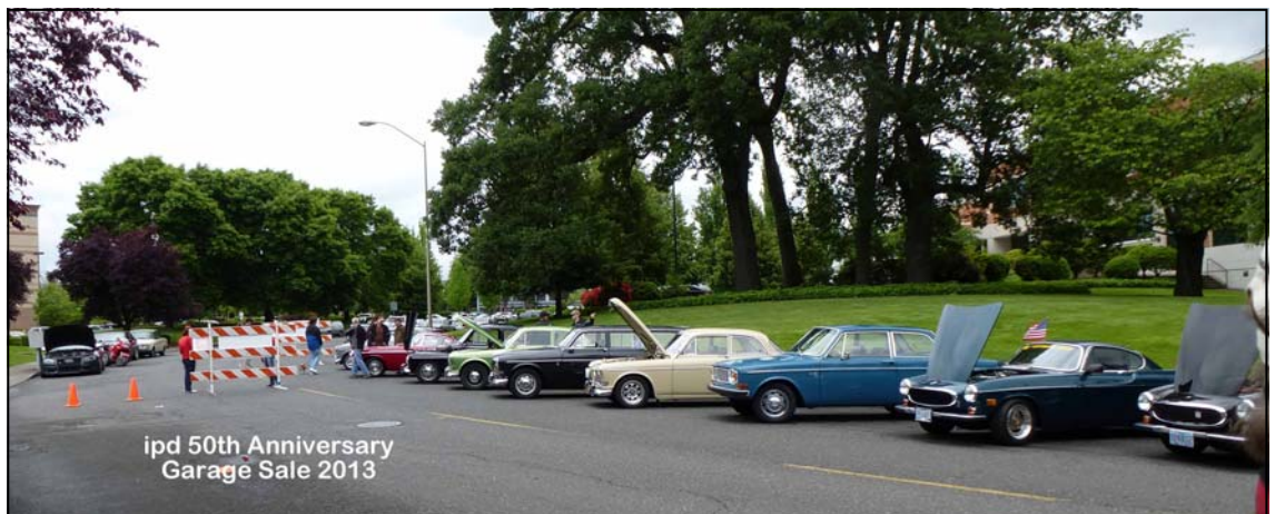
ipd 50th Anniversary Garage Sale 2013

Racer and spectator participation at the races is hugely dependant on the weather; rainy weekend - low participation. I had been watching the weather report for all week to see what was forecast for the race weekend and particularly our VCBC Sunday drive. I should have saved myself the frustration. The weather forecast for week and the weekend changed every day. I understand that with all the budget cuts, Environment Canada has to forecast the weather using a roulette wheel, but even at that you would think they would get it right once in a while. Predictably the final 'partly cloudy'