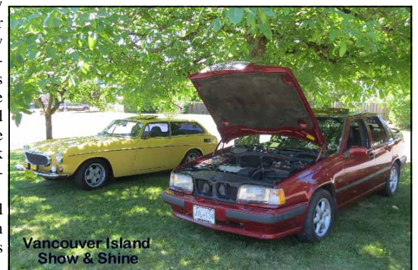
Vancouver Island Show & Shine

motive, our newest aftermarket Volvo shop just down the street in Saanichton, who sponsored this year's award. And a special thanks to all our supporters throughout the year, Landsman Motors, Chapman Motors (three locations), Dancia Motors and the Courtenay Car Centre.