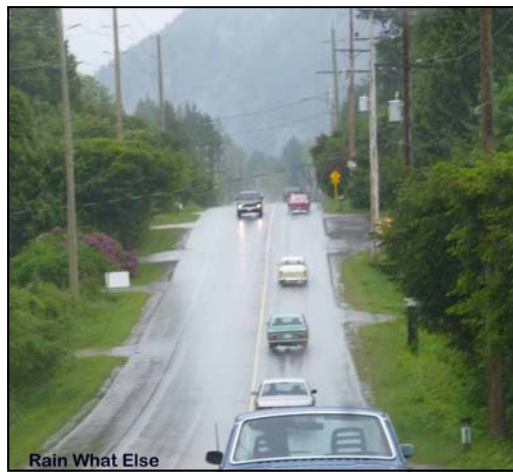
Rain What Else