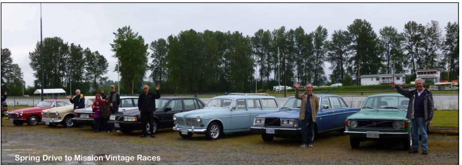
Spring Drive to Mission Vintage Races