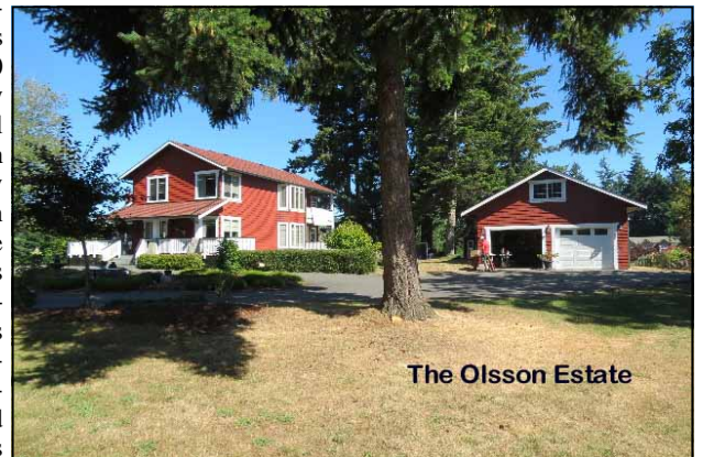
The Olsson Estate