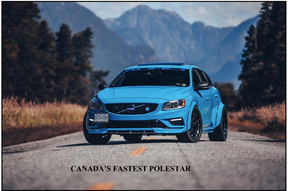
CANADA'S FASTEST POLESTAR