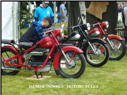
DANISH "NIMBUS" MOTORCYCLES

On Sunday afternoon the famous wife carrying contest was held on a demanding circuit. Apparently this is a Scandinavian traditional competition. There were a cou-