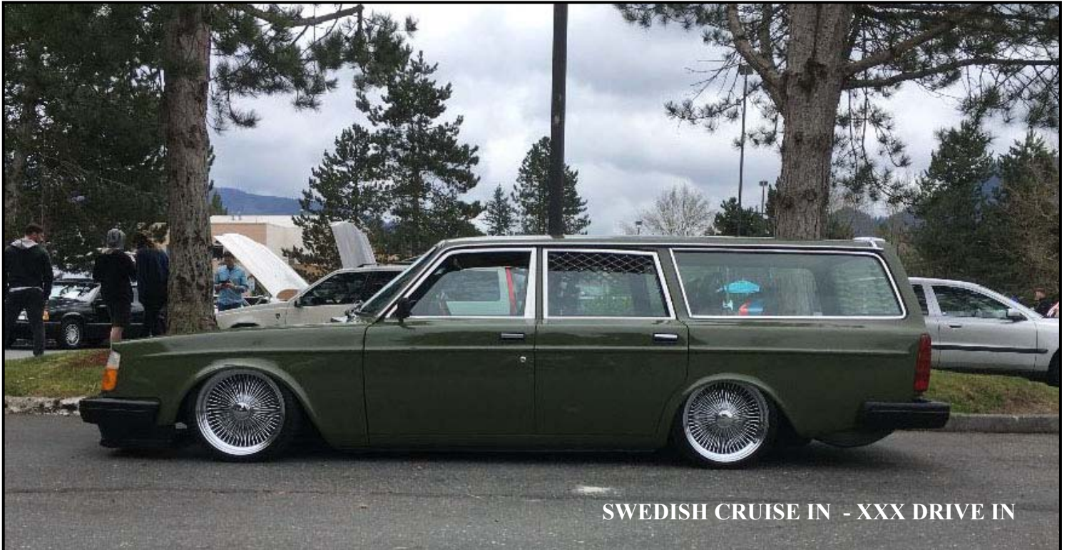
SWEDISH CRUISE IN - XXX DRIVE IN