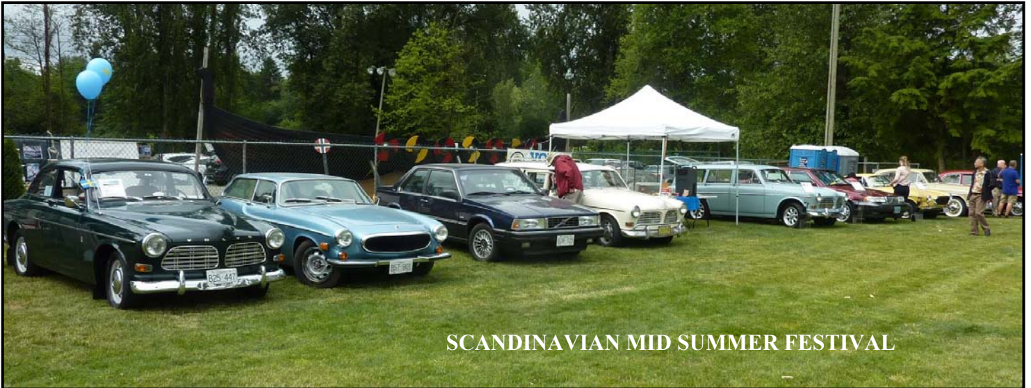
SCANDINAVIAN MID SUMMER FESTIVAL

bypass both and head for the Danish open face sandwiches, Salmon, Shrimp, Herring and you can even top off your meal with a Danish danish.