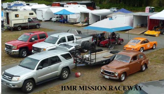
HMR MISSION RACEWAY