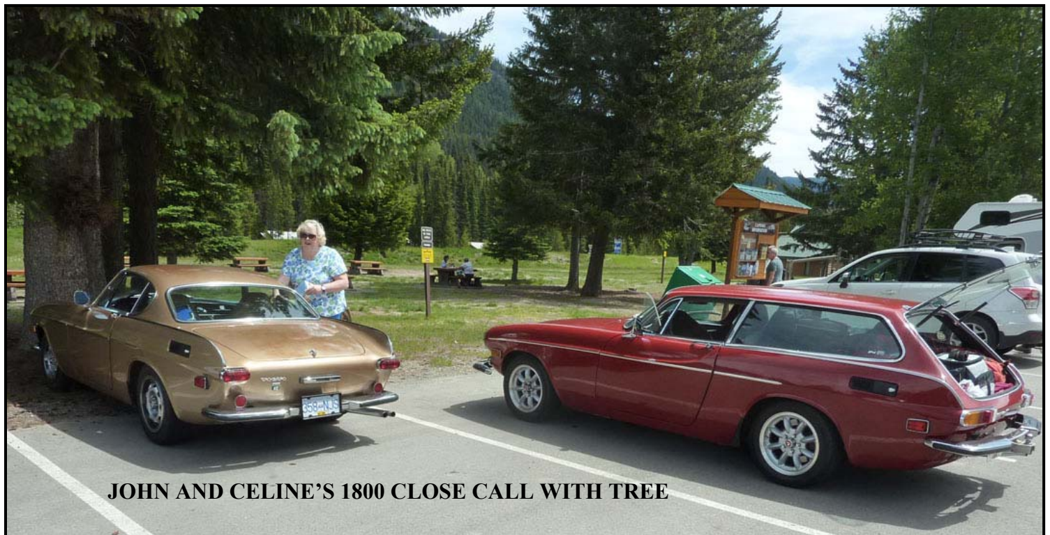
JOHN AND CELINE'S 1800 CLOSE CALL WITH TREE

Thursday we crossed the US Border to take a circle tour west from Oroville along the Similkameen River and then south through Loomis and back east to Tonasket for lunch. The border guard was pure nasty, but the drive was quick and quite beautiful. As I slowed for the bridge entering Tonasket my ES exhaust started popping and then a big back fire. OH Shoot! So much for the relaxing trip. The popping and back-firing was the same as it had been in 2017. It is a sign the engine had gone very lean, so for lack of a better idea I richened the mix-